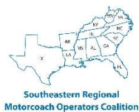
Southeastern Regional Motorcoach Operator's Coalition